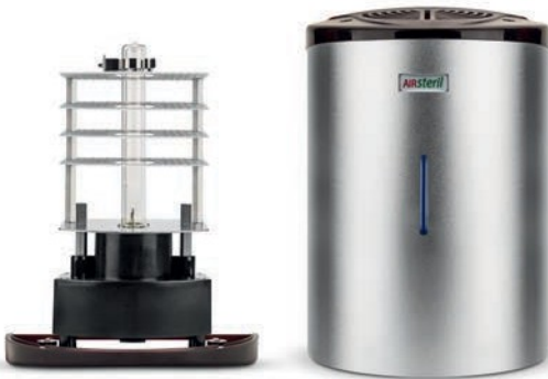
AS10 // AM10X // AS10M