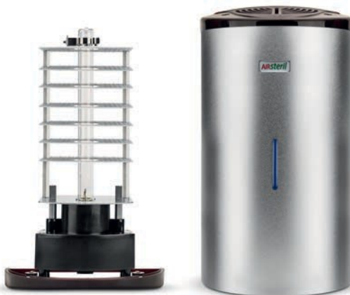
AS20 // AS20X // AS20M