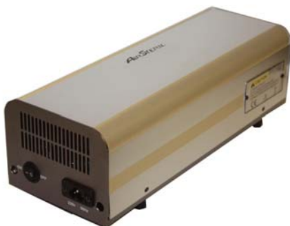
Air Steril MP 20 Test Unit

The HPA results on both air and surface contaminants clearly show the value of this technology as part of the infection control process in any medical environment. In addition to the extensive laboratory testing and validations the Air Steril units have been successfully installed, studied and tested in a variety of real world environments (customer reports and testimonials are available on request).